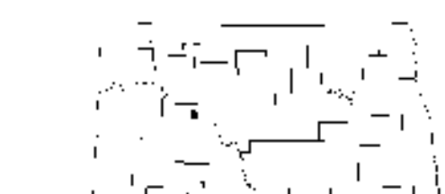
Blackwater Lake NW Quadrangle, North Dakota