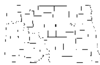
Clifton Quadrangle, North Dakota