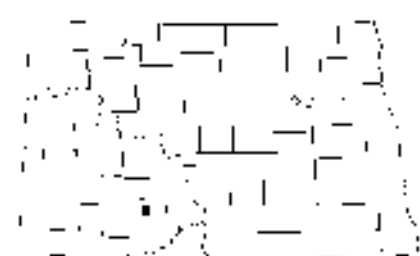
Crown Butte Creek SW Quadrangle, North Dakota

Scale 1:24,000 0 0.5 1 Miles Lambert Conformal Conic Projection Standard Parallels 46° 30' 00" and 46° 37' 30" 1927 North American Datum NGVD 1929 USGS 7.5 Minute Topographic Map - Contour Interval 20 Feet