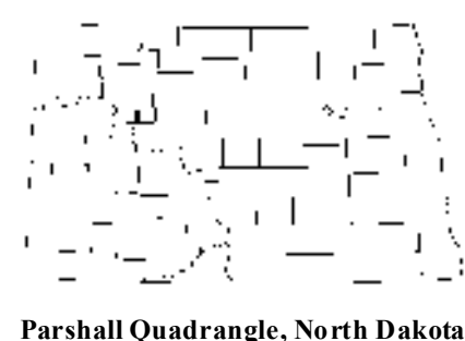
Parshall Quadrangle, North Dakota