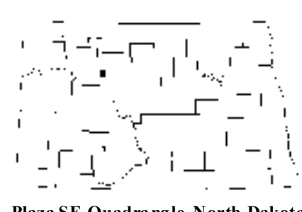
Plaza SE Quadrangle, North Dakota