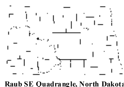
Raub SE Quadrangle, North Dakota