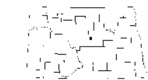
Sheyenne Lake NE Quadrangle, North Dakota