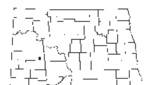
Marshall SW Quadrangle, North Dakota