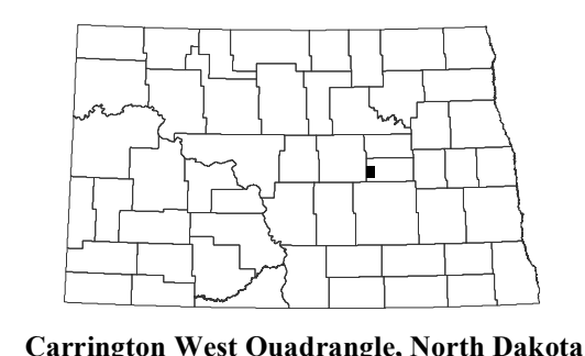
Carrington West Quadrangle, North Dakota